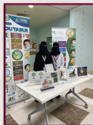
Editors from Faculty of Pharmacy in APGG