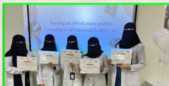
Department of Nursing Editors visit to Tabuk International School