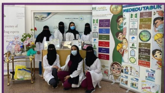
Faculty of Pharmacy Editors visit to King Abdulaziz School Tabuk