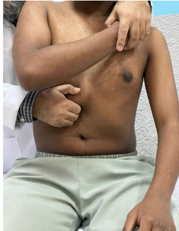
Figure 1: Murphy's Sign elicited by deep grip palpation technique

The examination is conducted from the front in the patient in an upright or supine posture. The extended fingers of the clinician apply moderate pressure and palpate deeply (Figure 2) while the patient is requested to take a deep breath [17-18]. In acute cholecystitis, there would be a catch in the breath as is the deep grip palpation technique.