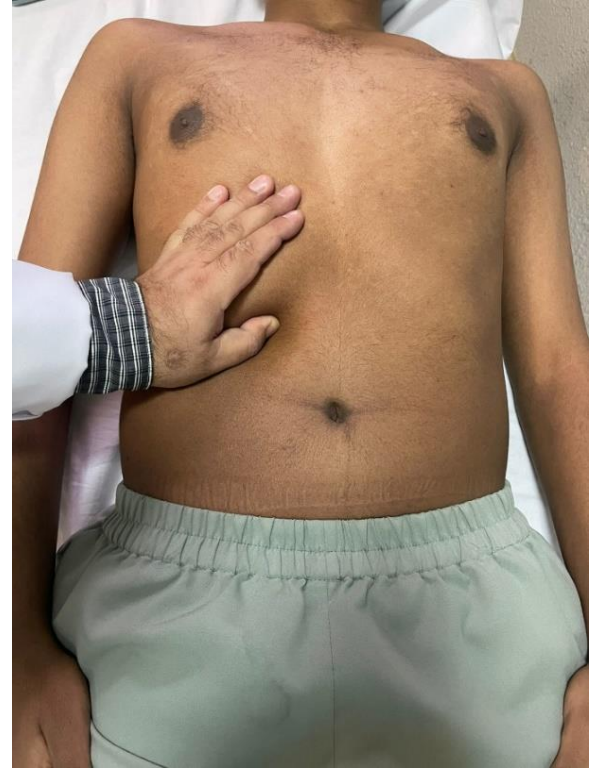
Figure 3: Murphy's Sign elicited by Moynihan's modified technique

This maneuver is based upon perpendicular percussion (Figure 4) and was described by Murphy himself [15,17].