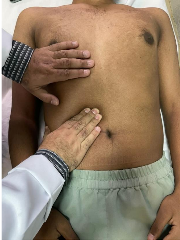
Figure 2: Murphy's Sign elicited by Naunyn's modified technique

down and into the patient's belly while the patient is requested to take a deep breath [17]. As the inflamed gallbladder presses against the thumb, the patient experiences pain enough to halt inspiration (usually at the end of inspiration). On repeating the maneuver but without pressing in with the thumb, if the patient can complete a full inspiration without any halt, then Murphy's sign is deemed as positive for acute cholecystitis.