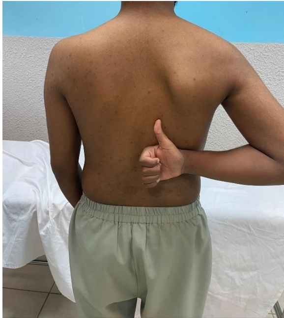
Figure 6: Collin's sign (elicited when the patient directs his thumb towards a painful infrascapular area)

the surgical literature in the field of biliary surgery, particularly biliary reconstruction. His findings on the physiological implications of external bile loss and primary closure of the common bile duct will be remembered for a long time [32].