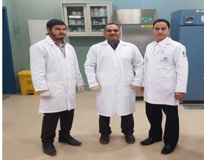
Figure: Group working on genetic disorders at Faculty of applied medical sciences.

or transplantation within 5 years of diagnosis. The overall incidence of cardiomyopathy in children < 18 years of age in the United States is 1.13 cases per 100000 annually. Cardiomyopathy in the pediatric population is diverse and may be caused by a number of different factors, including both genetic and non-genetic etiologies, posing an intense diagnostic challenge to clinicians. As a result, the majority of cases are still considered idiopathic. More than 100 genes have been identified causing cardiomyopathy related phenotypes and these genes belong to diverse molecular pathways, implicating the involvement of contractile proteins, intracellular calcium handling, and myocardial energetics as etiologies. Comprehensive genetic diagnosis has been problematic because of the large number of genes, the private nature of mutations, and difficulties in interpreting novel rare variants.